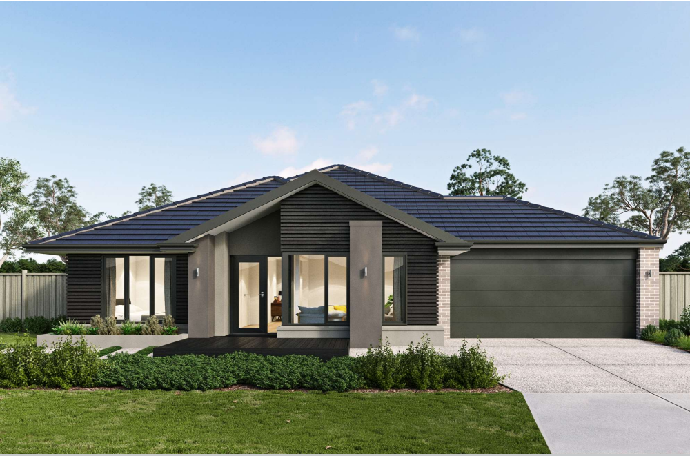
Pricing excludes Fencing, Landscaping, Concrete pavers, Planter boxes, Driveway, Decking